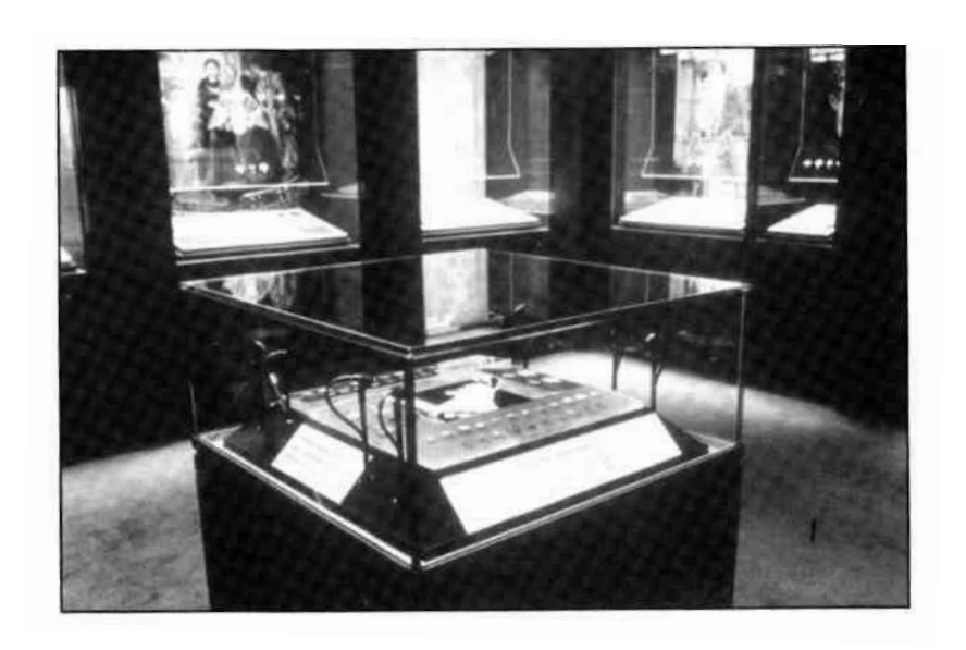
FIG 2. New display-case exhibiting the most notable of new acquisitions.