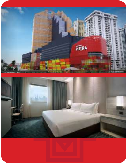
Sunway Putra Hotel