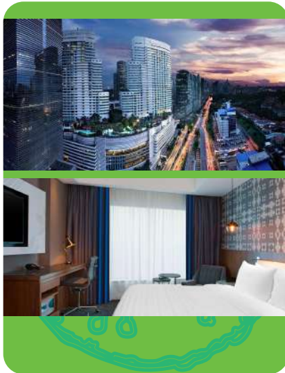
Le Meridien Kuala Lumpur

4.7 KM, 10 minutes from Sasana Kijang, BNM https://www.marriott.com/en-us/hotels/kulal-aloft-kuala-lumpur-sentral/overview/