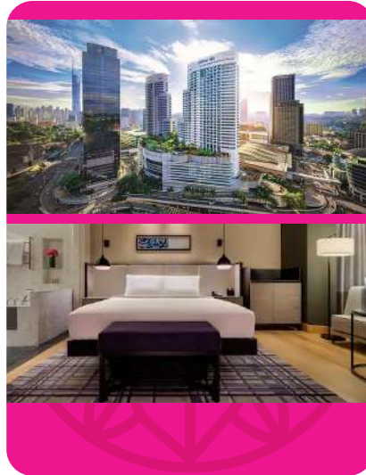
Hilton Kuala Lumpur

2.6 KM, 8 minutes from Sasana Kijang, BNM https://www.sunwayhotels.com/sunway-putra