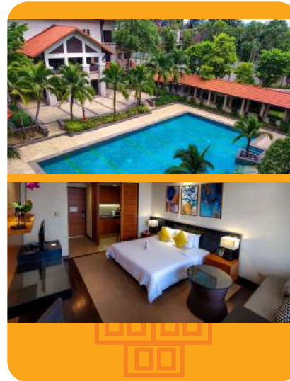
Lanai Kijang, Bank Negara Malaysia

5.0 KM, 13 minutes from Sasana Kijang, BNM https://www.marriott.com/en-us/hotels/kulmd-le-meridien-kuala-lumpur/